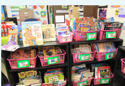
Colorful bookshelves surround Brandon's students.