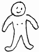
NUDE NEUTER NUDIST

Weigh-Wayer waist “Get the midriff you always wanted at Dr. Duck’s Anorexia Clinic!”