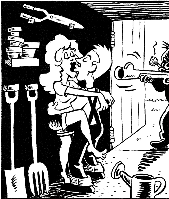
HOT IN THE SHED