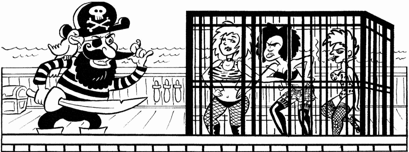
BRIG FOR HIS BITCHES