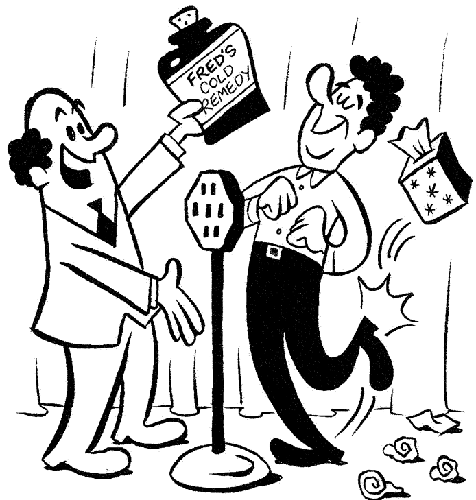
"THE RHEUM IS OFF THE BLOWS."