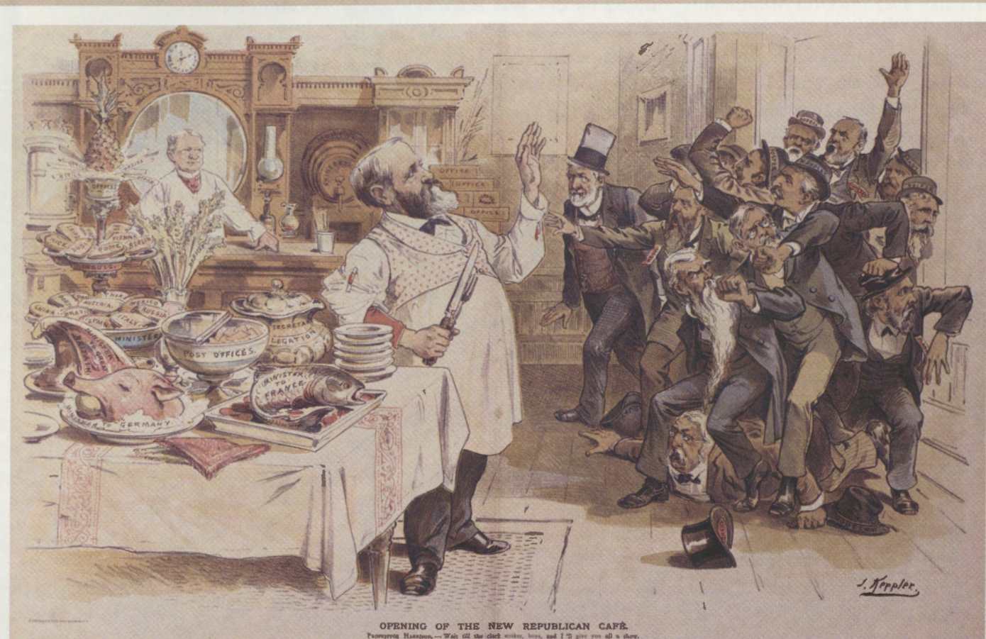
JOB SEEKERS BESIEGED HARRISON IN THE FIRST MONTHS OF HIS PRESIDENCY. IN THIS CARTOON, WHICH APPEARED IN PUCK, HARRISON IS PREPARED TO DISH OUT POLITICAL APPOINTMENTS TO A NUMBER OF PROMINENT REPUBLICANS.

The concern and compassion of his speeches regarding the slave and, later, the freedman were hallmarks of his rhetoric.