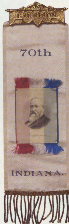
REPUBLICANS FREQUENTLY USED HARRISON'S CIVIL WAR EXPERIENCE TO PROMOTE THEIR CANDIDATE.

the last Indian battle, at Wounded Knee in 1890, and Harrison used the subsequent inquiries to justify army reforms that prefigured Elihu Root's. Many forget that Harrison signed the Sherman Antitrust Act, appointed Theodore Roosevelt to the Civil Service Commission, and dramatically recast the direction of