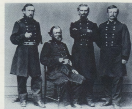
DURING THE CIVIL WAR, BENJAMIN HARRISON PARTICIPATED IN GENERAL WILLIAM TECUMSEH SHERMAN'S GEORGIA CAMPAIGN. AFTER THE BATTLE OF PEACHTREE CREEK, HARRISON (LEFT) WAS PROMOTED TO BREVET BRIGADIER GENERAL.

The Second Indiana Cavalry was the first full cavalry regiment I ever saw. I saw it marching through Washington Street from