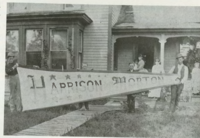
A FAMILY SHOWS ITS SUPPORT FOR HARRISON AND RUNNING MATE LEVI P. MORTON OF NEW YORK IN THE 1888 CAMPAIGN.

Harrison enjoyed confronting adversaries. He did it in the courtroom, in the army, and on the speaker's trail. He did it well, marshaling evidence, argument, and biting humor. Not surprisingly he used his Senate seat to oppose the Democrats, especially after the 1884 election handed him a Democratic president to challenge. Grover Cleveland was so much that Harrison was not: an Easterner, a draft dodger who had hired a substitute in the Civil War, a free trader, and a factional man from another party. Even the loss of Harrison's Senate seat in 1886 failed to blunt the regard he won