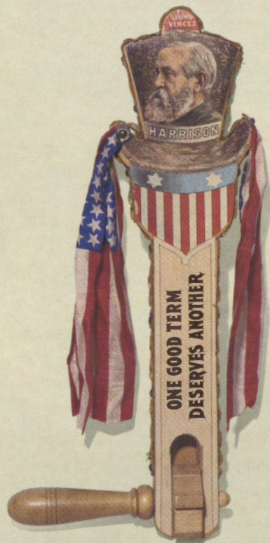
A NOISEMAKER FROM BENJAMIN HARRISON'S REELECTION CAMPAIGN, 1892.