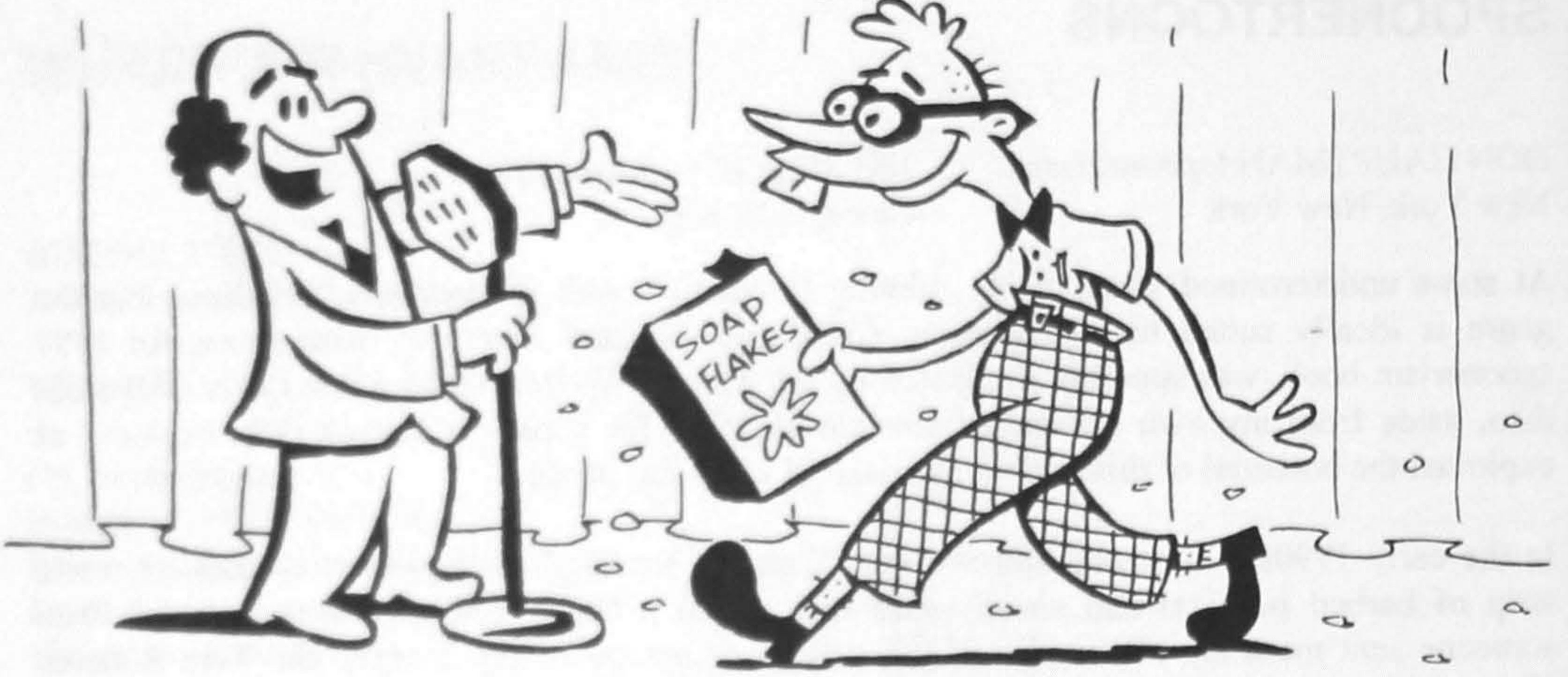
"WOW! A NERD FROM OUR SPONSOR!"