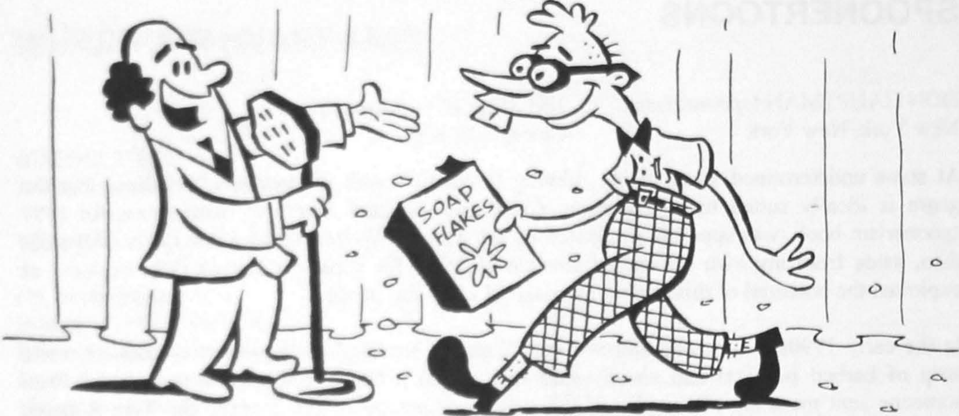
"WOW! A NERD FROM OUR SPONSOR!"