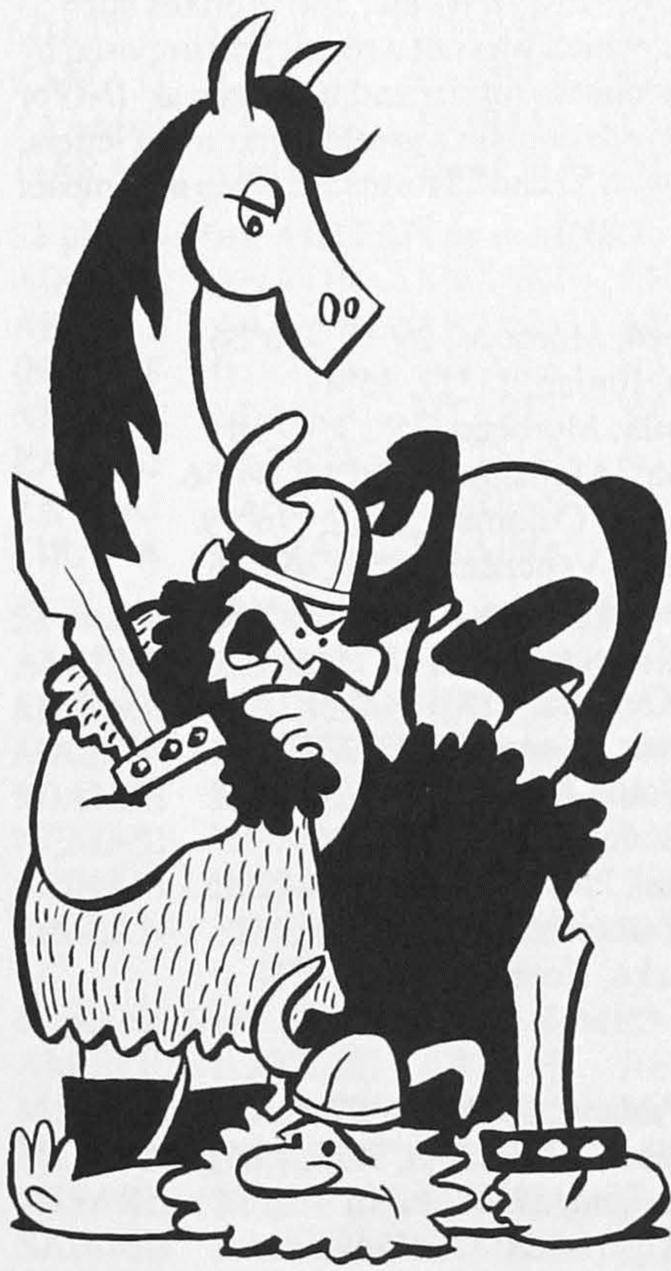
"YOU CAN HUN, BUT YOU CAN'T RIDE"