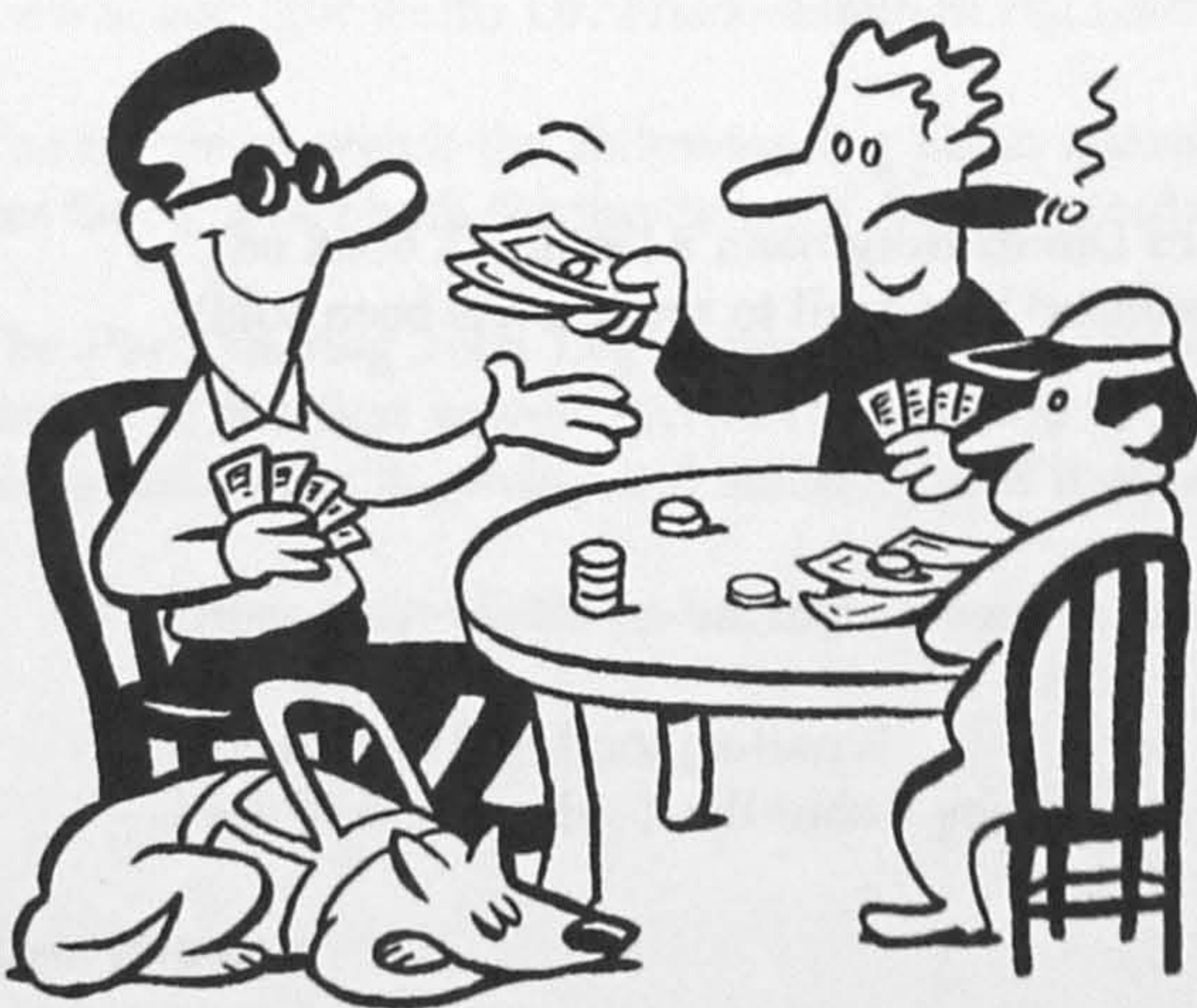
STAKING A BRAILLE MATE