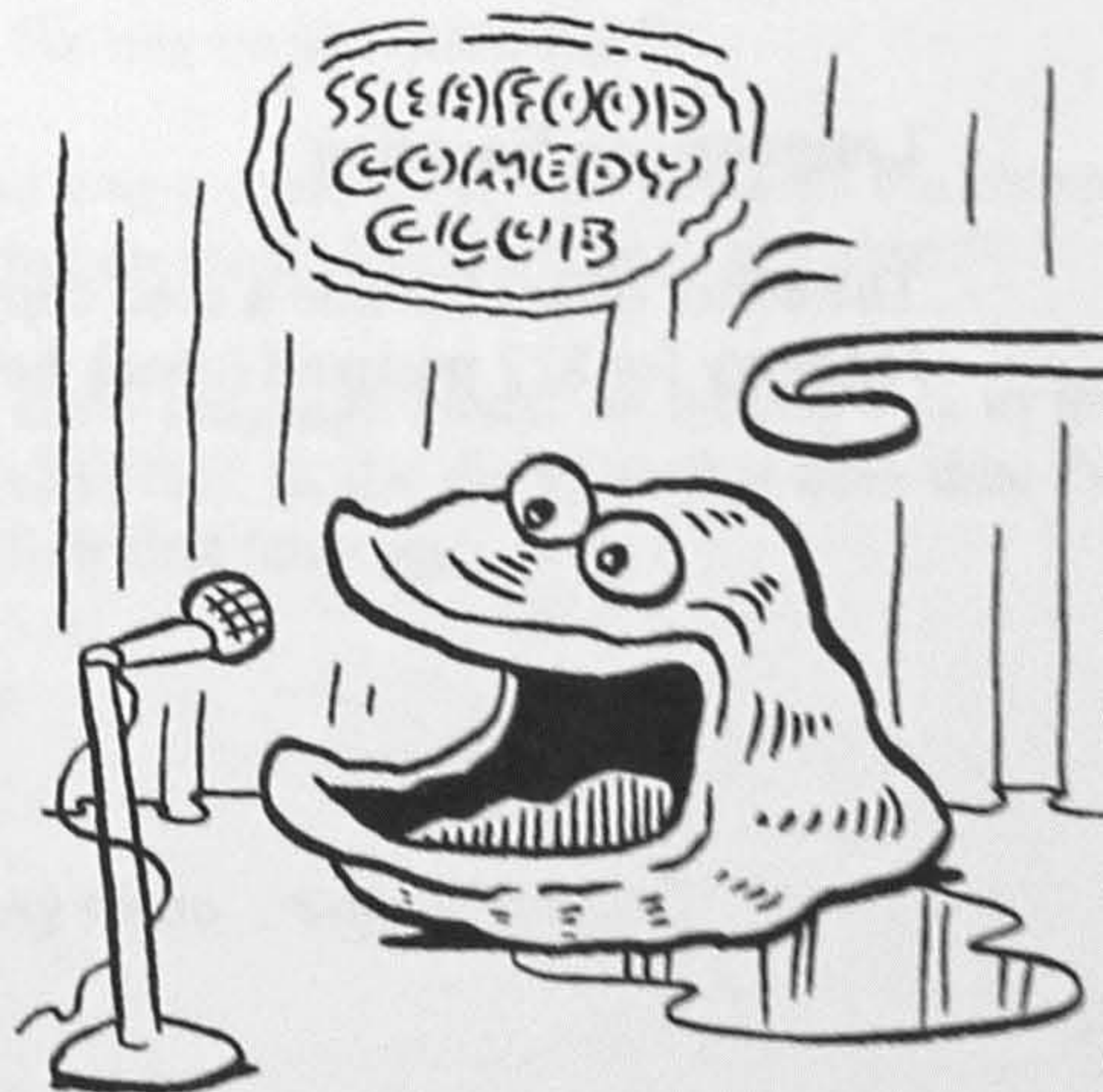
A MOULE AND HIS FUNNY ARE...