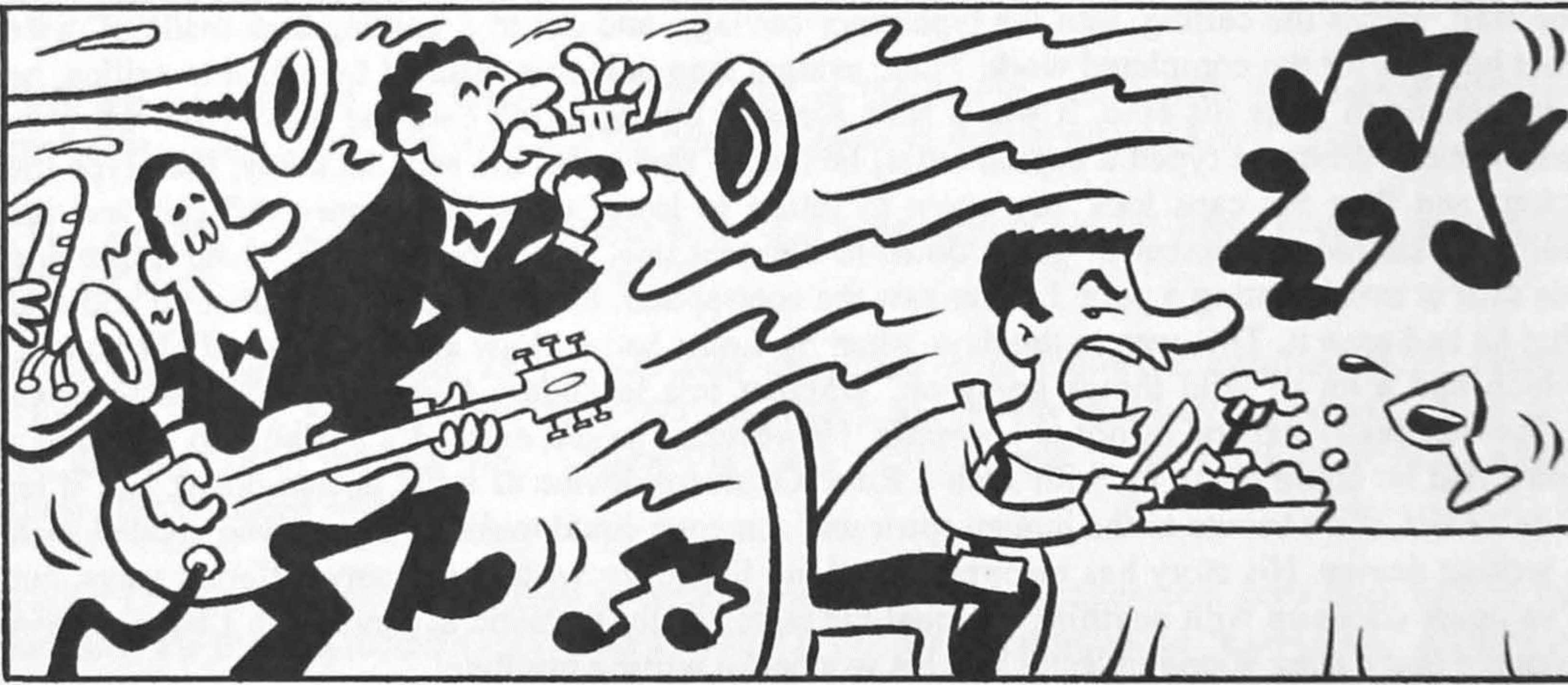
A BITE OUT WITH THE NOISE