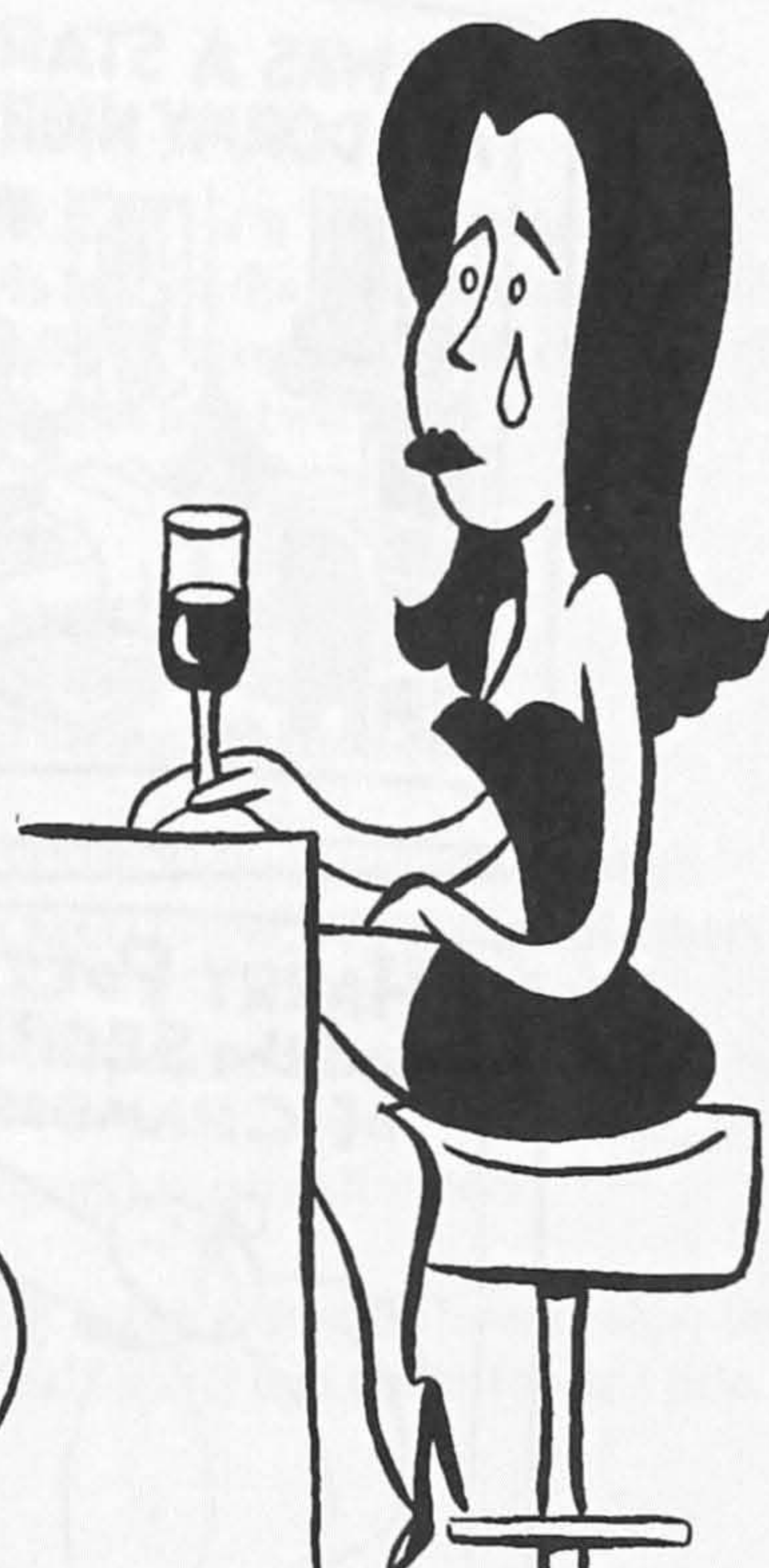
"I CRIED A TEAR WHEN I TRIED A KIR"