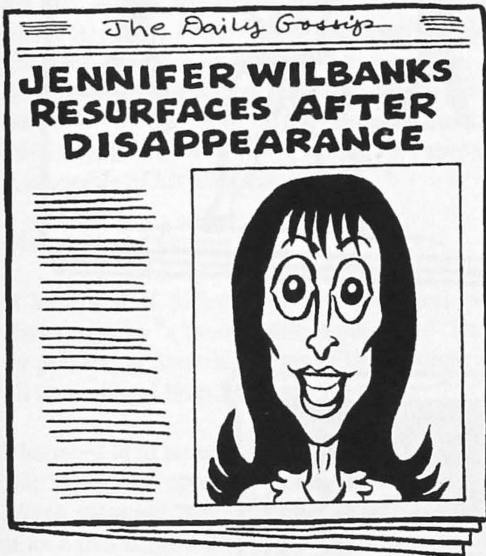
FAKED, NOT BRIDE

As an annual tradition, one we trust is much anticipated, we present a new set of original spoonerisms rendered into visual form. This is the third consecutive August issue of Word Ways in which our collaborative feature has appeared. By the way, although it's a few weeks too late to send him a card, July 22 was Dr. Spooner's 162 nd birthday.