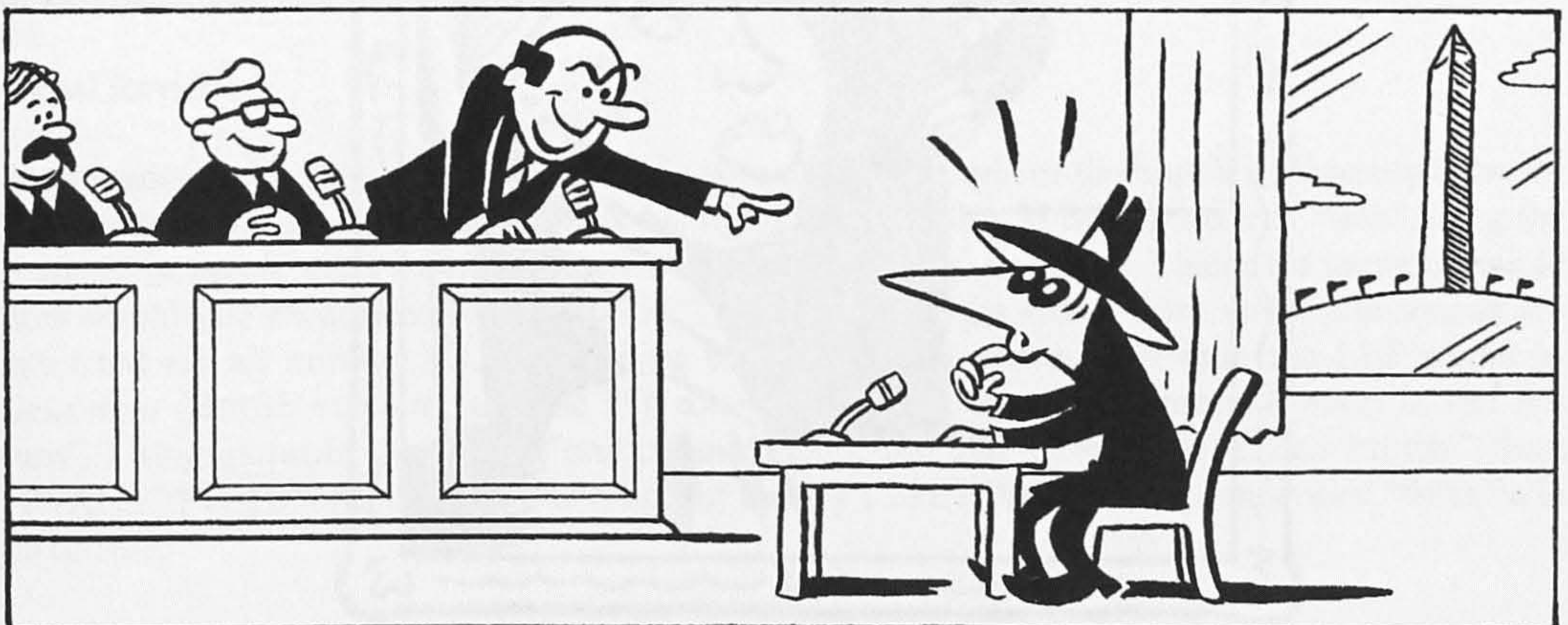
A DARE FOR THE PRYING