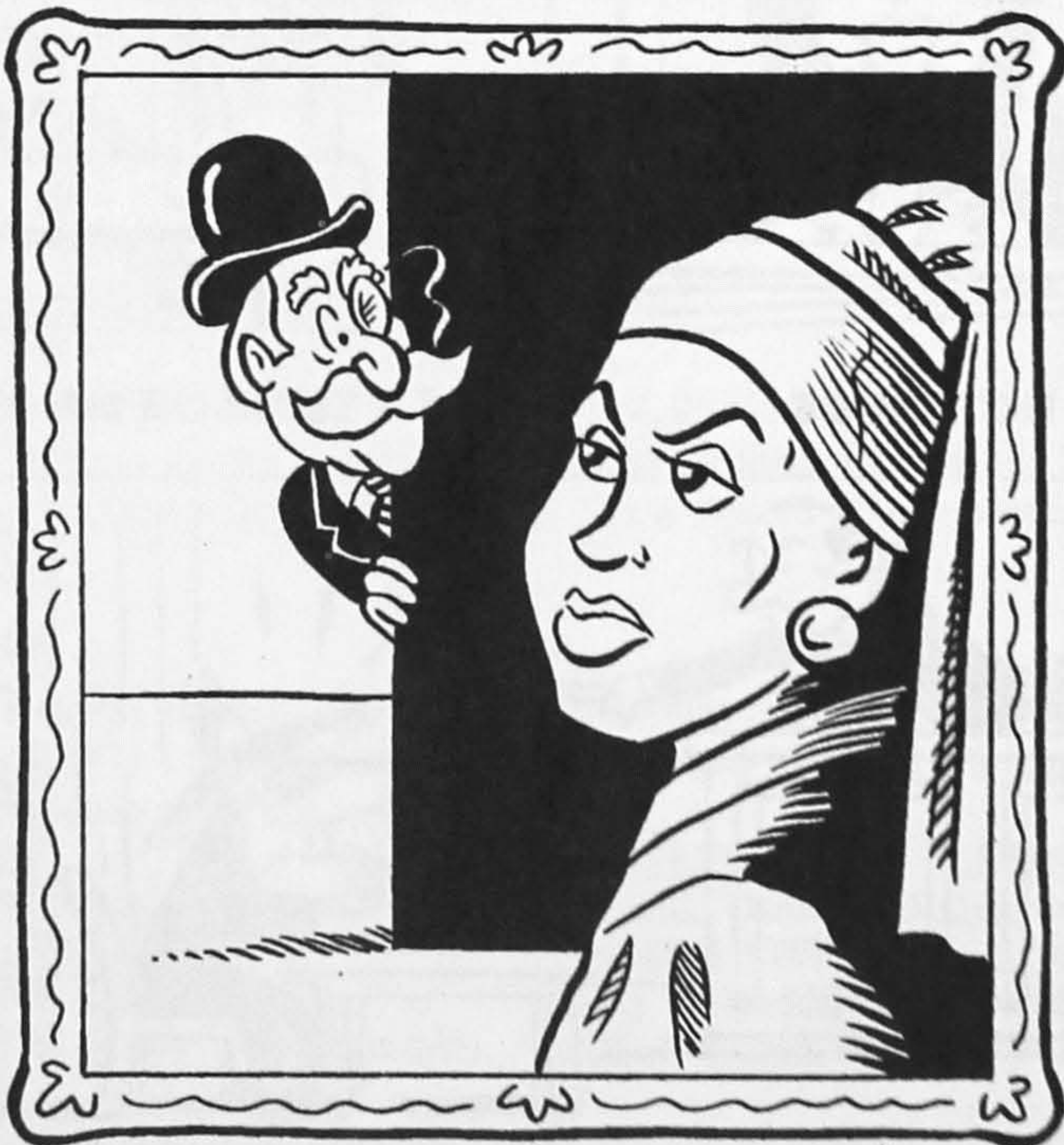
GIRL WITH AN EARL, PEERING