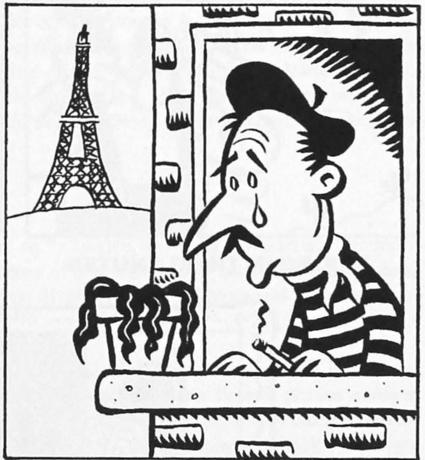
LA TOMB DE MA PLANT