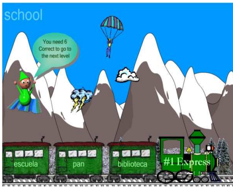
Fig. 1. Quick Drop game screenshot.